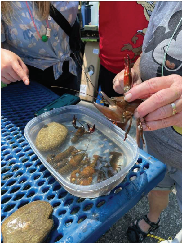
Left: Campers circle around the container of crawdads.