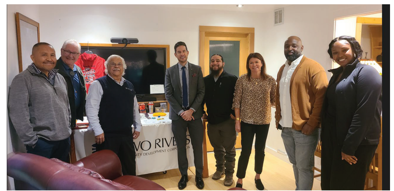
Open House: SBA Regional Administrator in Center