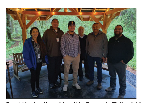
Group Discussion at Open House Seattle Indian Health Board, Tribal Liaison, Yakama Wood Products