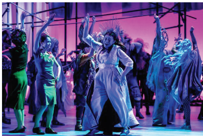
Cast of The Tempest.