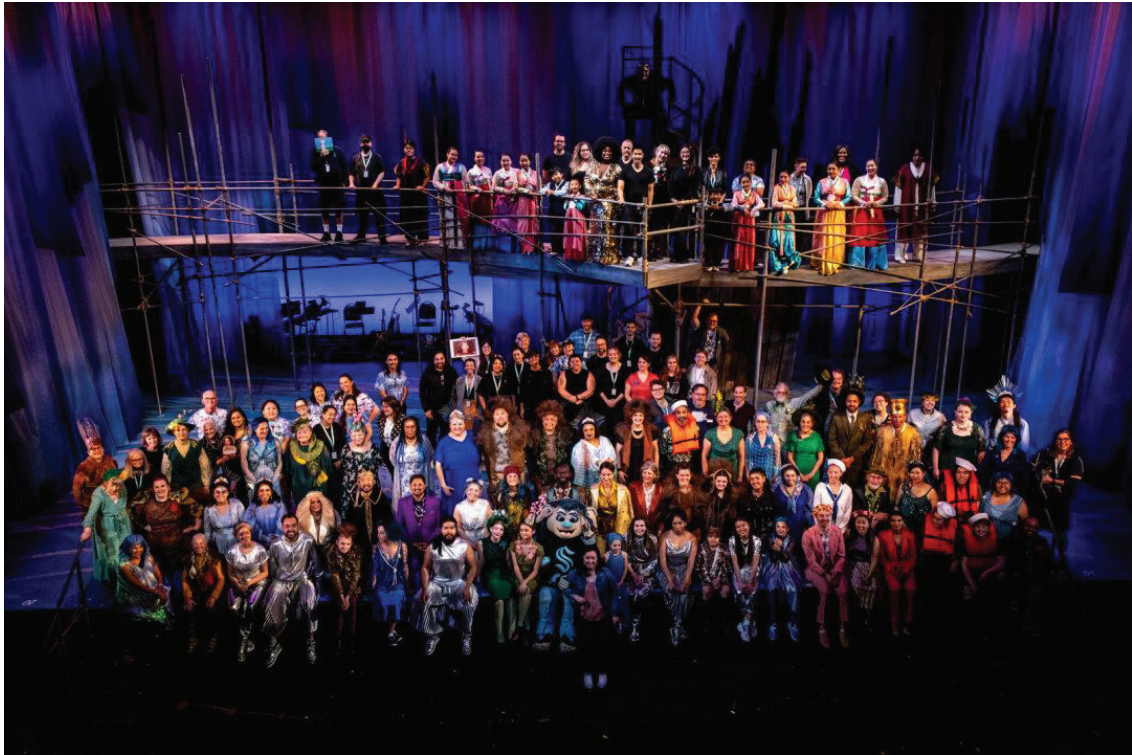
Cast, crew, cameo groups of The Tempest.