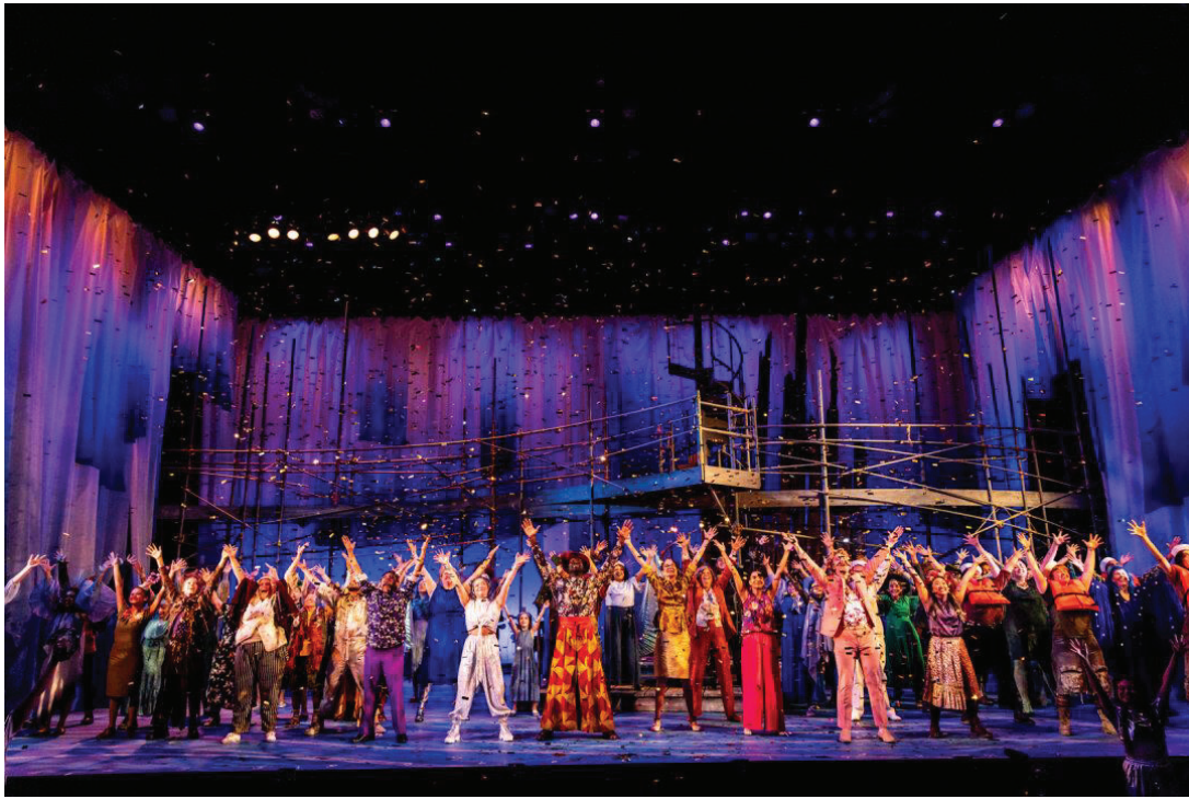
Cast of The Tempest.