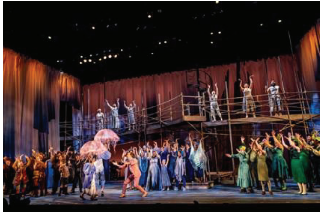
Cast of The Tempest.

Spring quarter began in April, with class offerings shifting to include movement and Shakespeare classes as well as the storytelling and musical theater classes, to best prepare participants to audition for and participate in The Tempest . Ballard Northwest Senior Center participants learned “So What” from Cabaret and “June is Bustin’ Out All Over” from Carousel , while Renton Veterans Center participants practiced storytelling with a variety of prompts, including “tell a story about love” and “tell a story about a mystery.” The mystery stories were particularly compelling, with a shared theme of overcoming difficulty to triumph throughout the group. The variety and excellence of the mystery stories prompted a Public Works staff member to comment, “everyone was on fire today!”