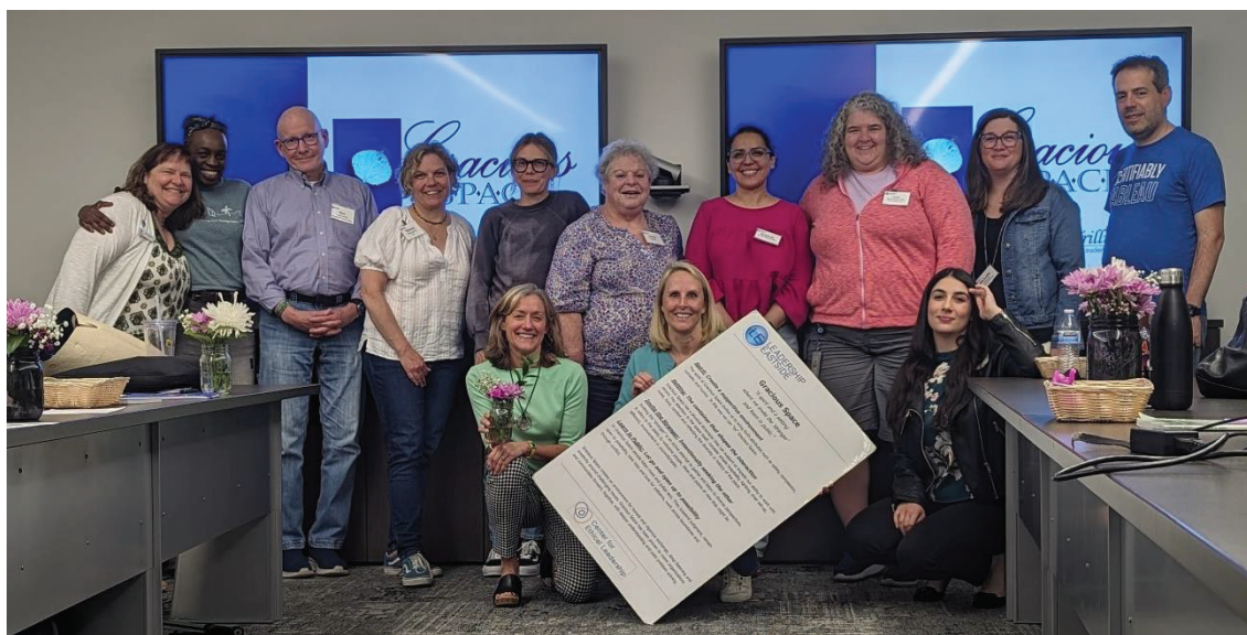
Figure 1: April 2024 Gracious Space Master Class

Leadership Eastside is so appreciative of the support from the Tulalip Tribes (Q4 2023 14.2) to help build capacity for our facilitators to hold critical conversations and build an environment for all our students to engage, learn and share the challenges of operating in a system of dominance that does not center their experience.