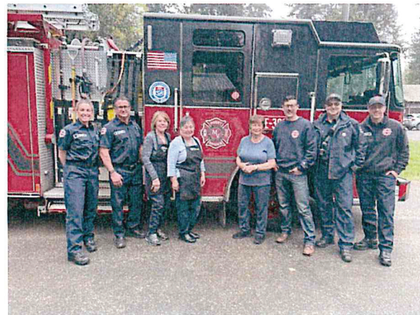
Ready to Take blood Pressures