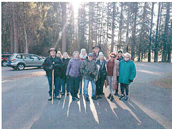
Staying health through walking