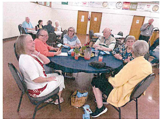
Fun at Lunch