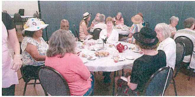
Mothers Day Tea