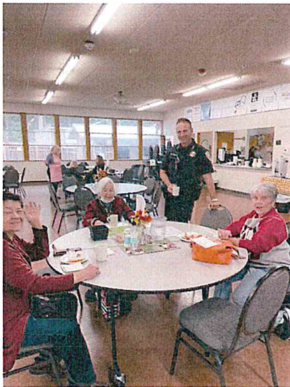
Coffee with a Cop