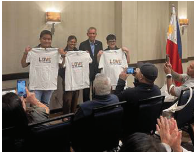
Consular clients were also treated to Filipino trivia games, which garnered enthusiastic participation from 2nd and 3rd generation Fil-Ams who surprisingly bested their parents. Winners were given "Love the Philippines" shirts from the Department of Tourism.

case management, repatriation assistance, capacity building, and welfare assistance.