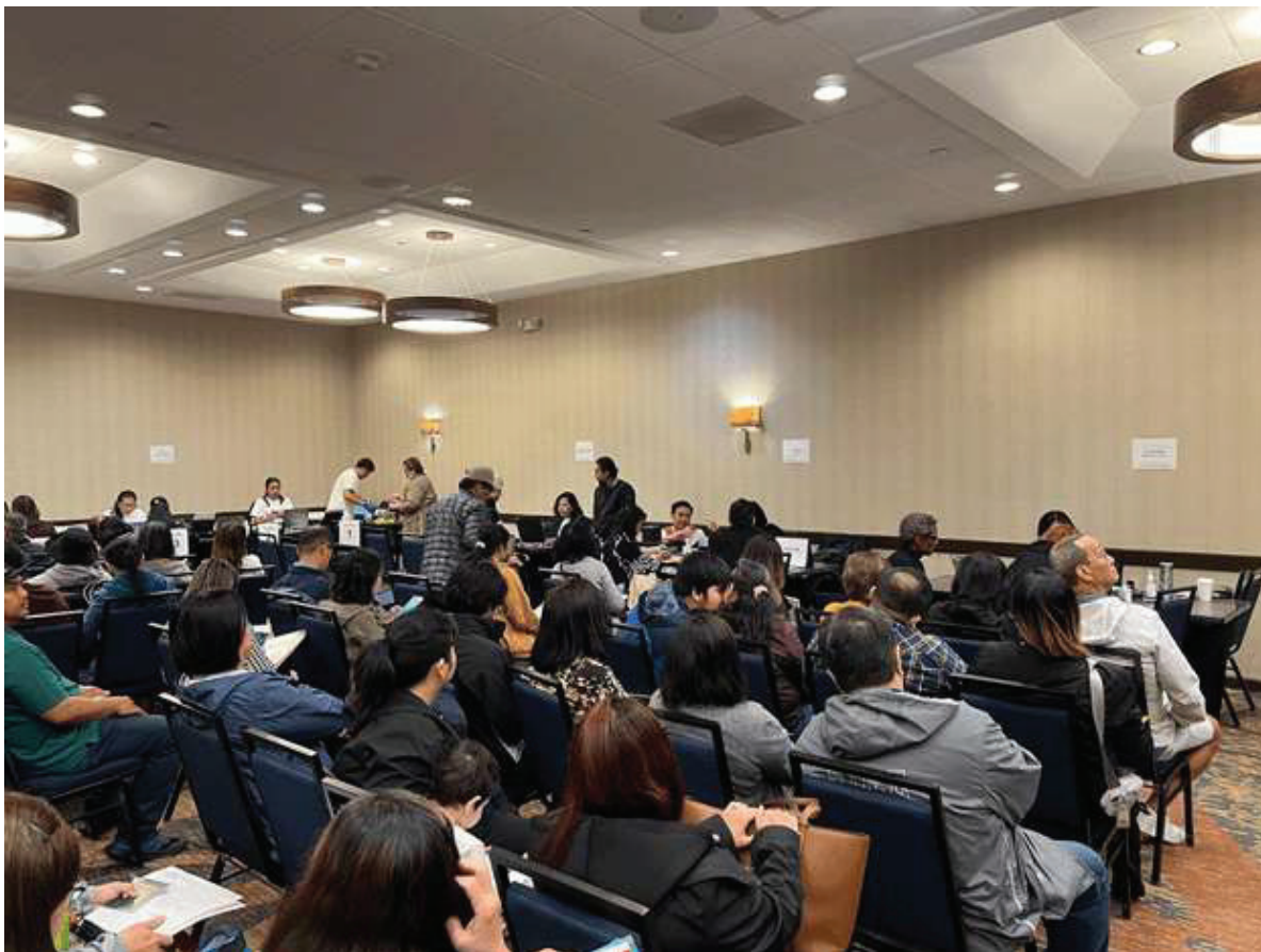
A total of 1,451 services were provided, including 443 passport applications, 565 dual citizenship petitions, and 417 overseas voting registrations.