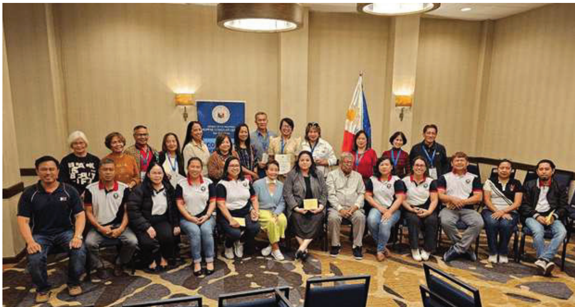
The PCG San Francisco team with representatives from various Filipino-American group who truly have demonstrated the bayanihan spirit of Filipinos by volunteering during the 5-day consular outreach

Filipinos residing under the jurisdiction of the Consulate may visit pcgsanfrancisco.org/consular-outreach-missions/ for details on the Consulate’s consular outreach programs. END