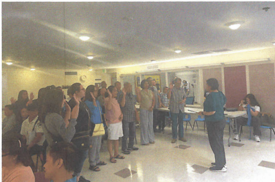
Top photo: Dual citizens who have reacquired/retained their Philippine citizenship being briefed before taking their Oath of Allegiance at the Philippine Consulate General in San Francisco's Consular Outreach Mission in Mill Creek, Washington on 29 July 2023.