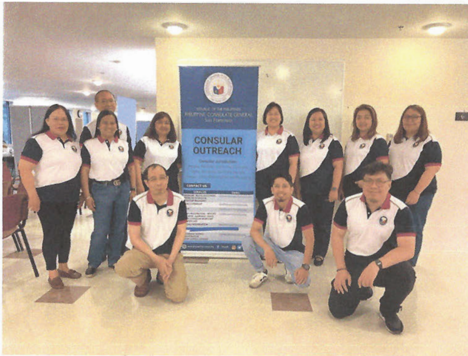
The Consulate Team at the Philippine Consulate General in San Francisco's Consular Outreach Mission in Mill Creek, Washington on 28 July 2023