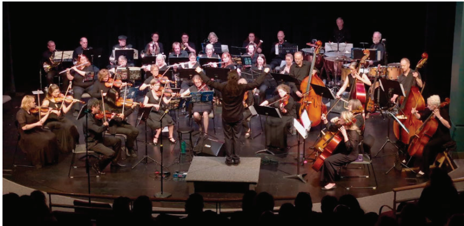
Evergreen Community Orchestra Fairy Garden concert- Performing Ravel (Orchestra Only)