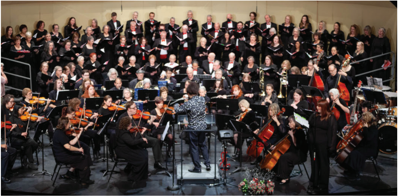
Evergreen Community Orchestra and Everett Chorale. Christmas Concert 2023