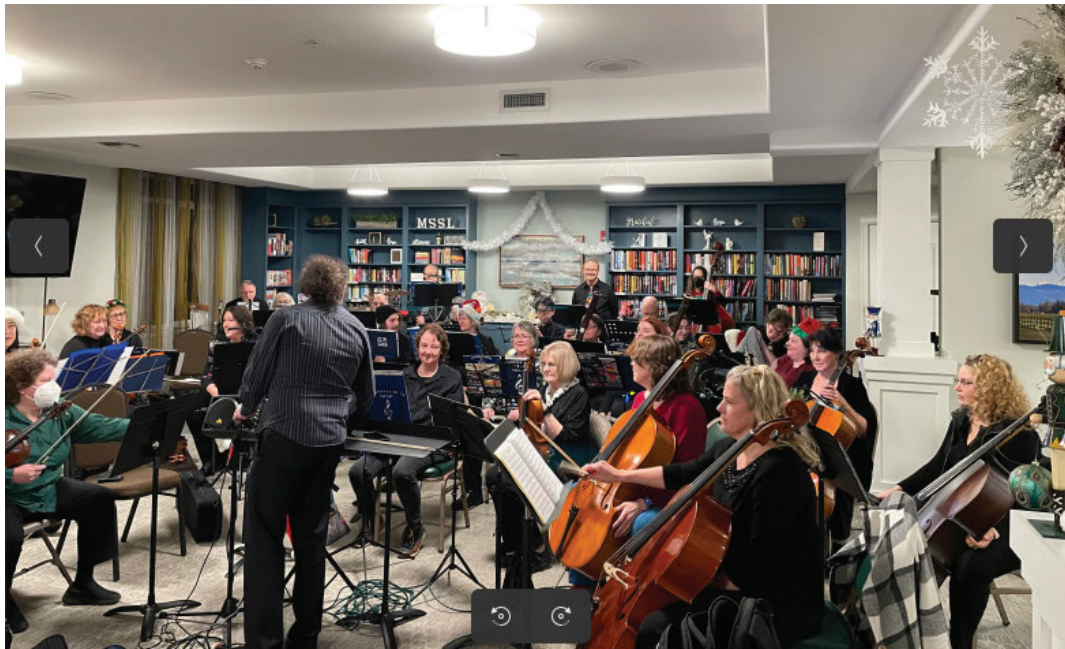
2023 Christmas program at Morning Star