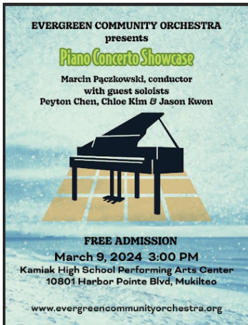
Piano Showcase Concert Poster