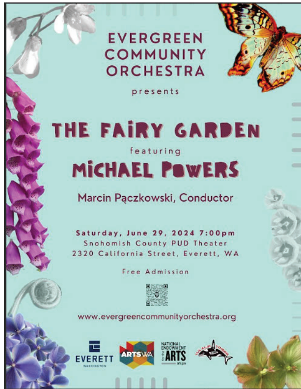
June Concert Poster 2024