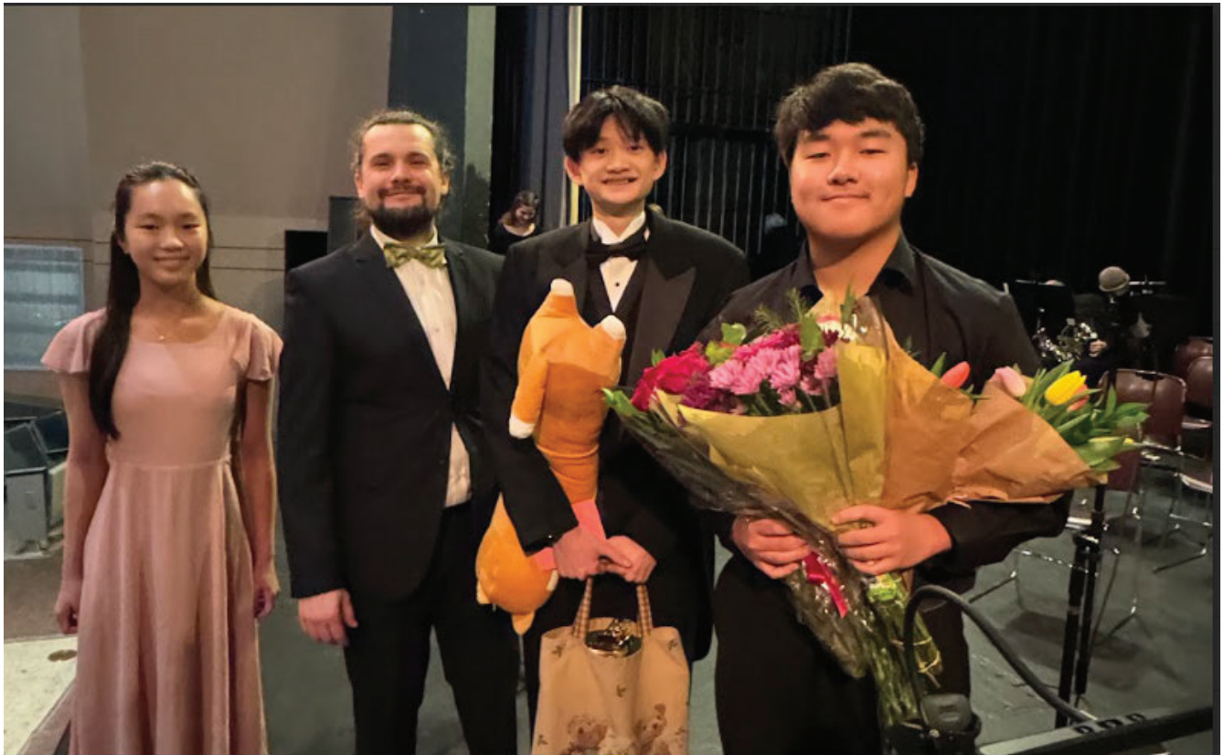
Piano Showcase Performers March 9, 2024. Unpublished