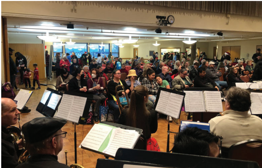
Wintertide at Gipson Center December 2023