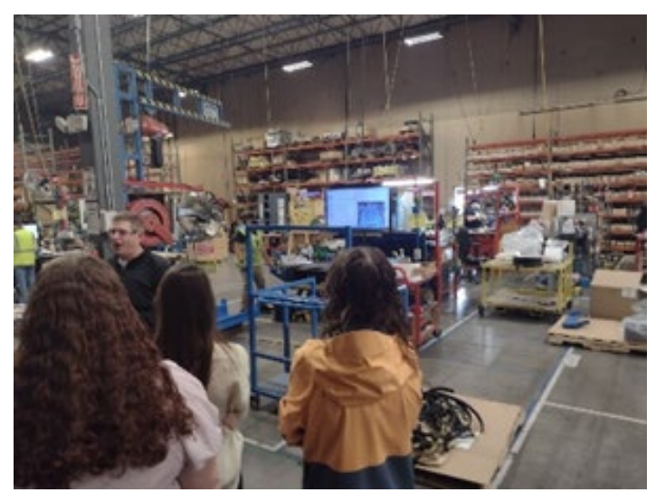
Worksite tour to Genie Industries - October 2023