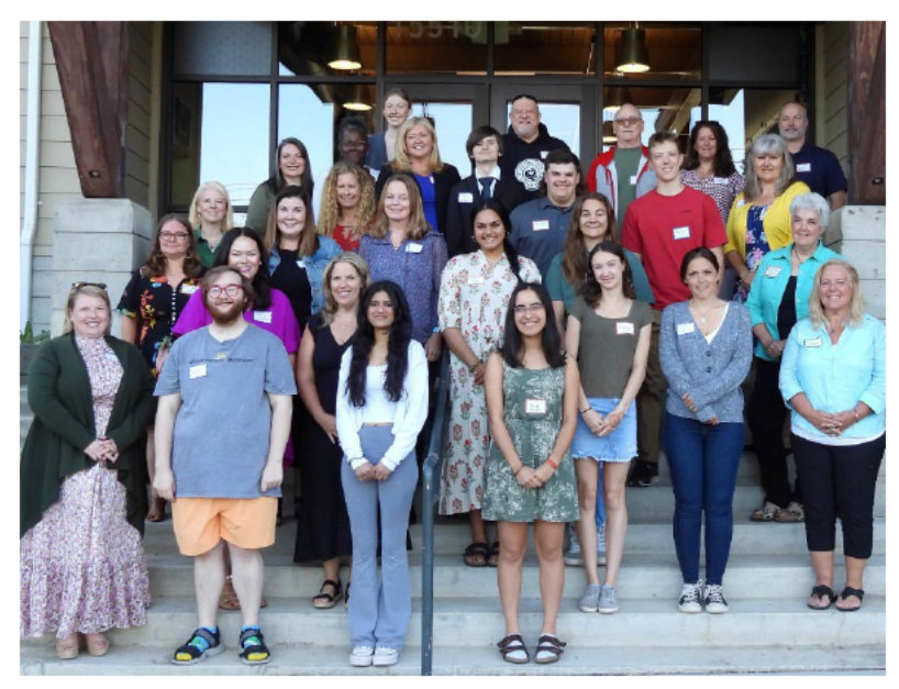
Rise & Shine volunteers, nominated for their commitment to community - June 2023