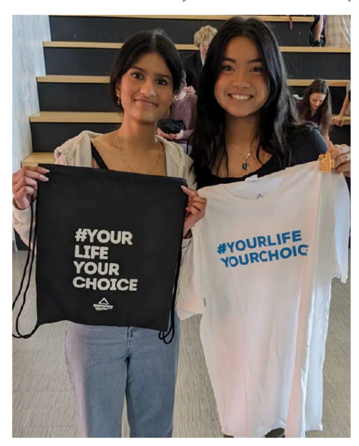
Students repping #YourLifeYourChoice swag for substance use prevention - September 2023