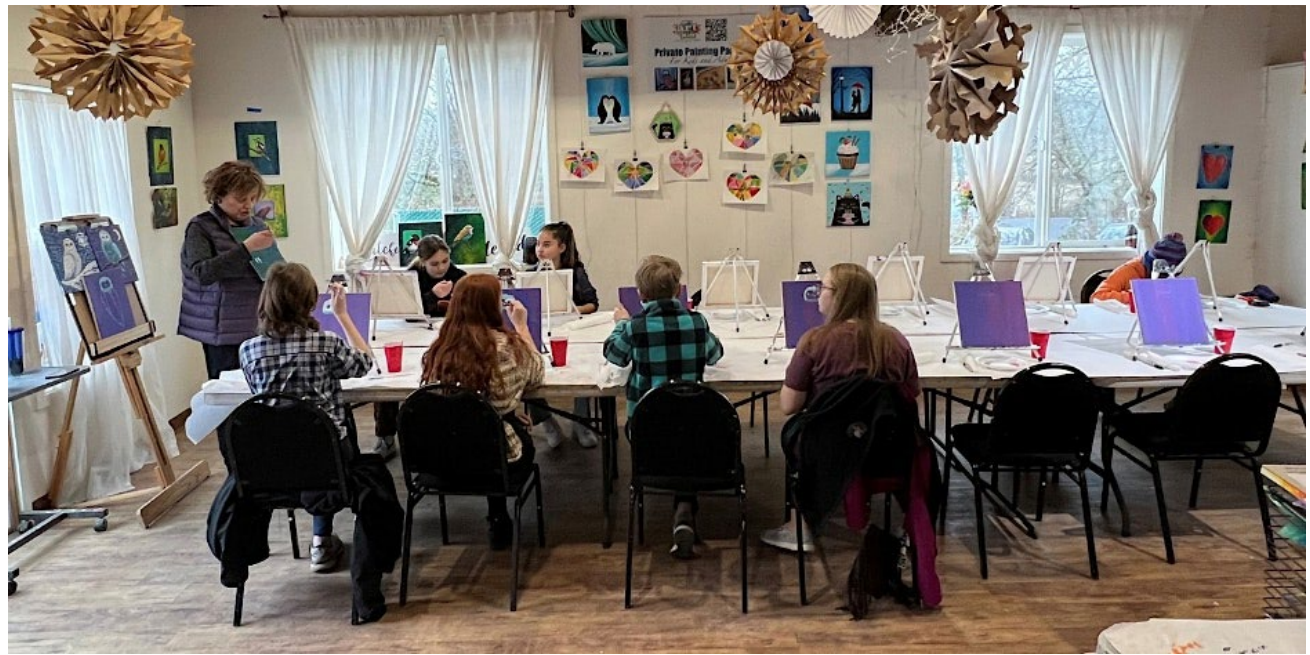
Youth engagement painting event - September 2023

Thank you once again for your belief in our mission and your invaluable support. We are truly grateful for the opportunity to collaborate with the Tulalip Tribes Charitable Fund in our shared commitment to empowering the next generation.