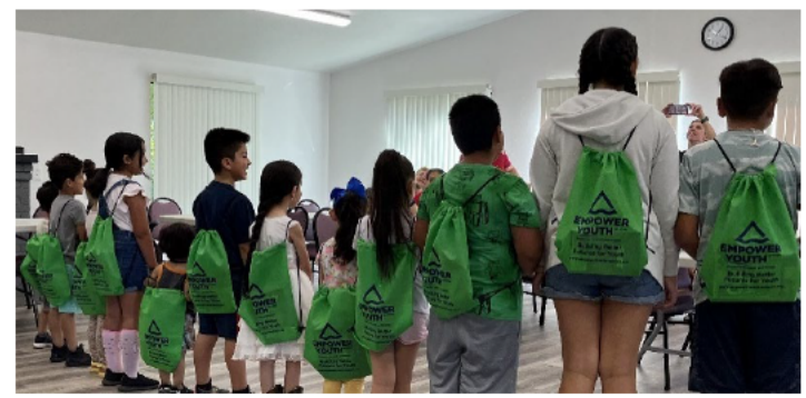
Summer Reading program - Summer 2023

Through the Summer Reading program, children and parents alike engaged with diverse storytelling. Adults that spoke one language and youth that spoke another connected through reading and built relationship with each other. Children learned alongside people that spoke different languages and were from other cultures, creating a space where all were equal.