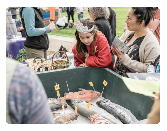
...and played their popular game, Guess the Fish.