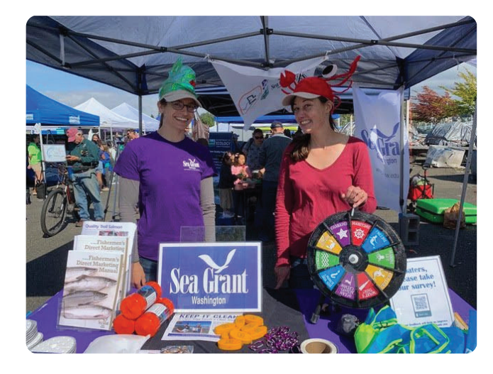
Passport participants checked in at the Washington Sea Grant table...