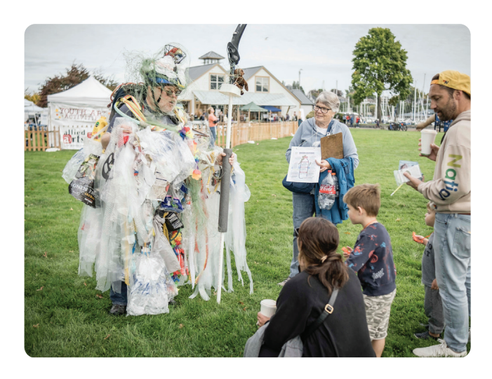
At Gabriel's Art Kids, families learn about the importance of recyling to keep our waterways clean.