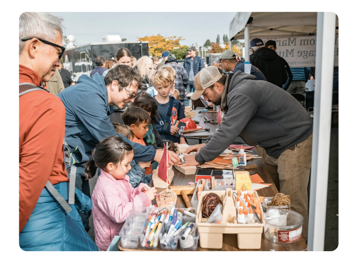
They also enjoyed a wooden boat building craft, which kids were able to take home.