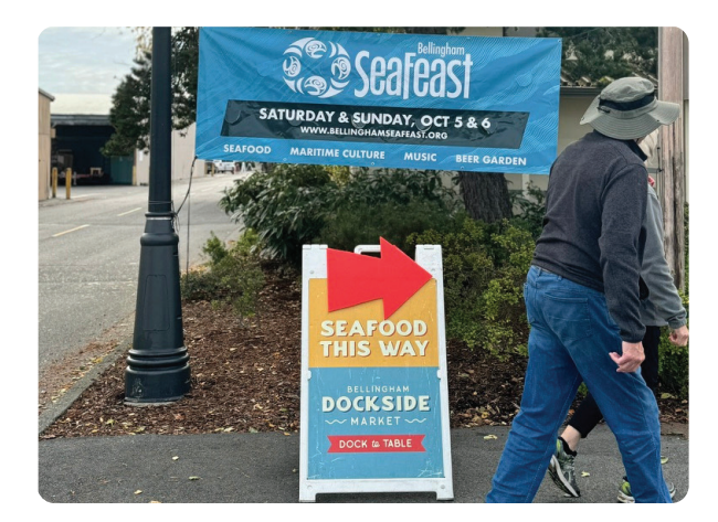
The Dockside Market at SeaFeast enjoyed thousands of customers buying fresh seafood directly from local fisherfolk.